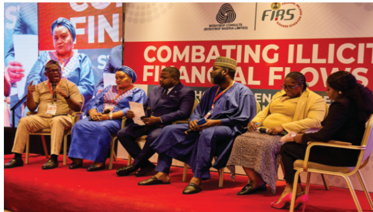
Panelist discussion at the STAKEHOLDERS ENGAGEMENT & SENSITIZATION FORUM “a programme organized by Boshybof Nigeria Limited , in Collaboration with The Federal Inland Revenue Service (FIRS)”