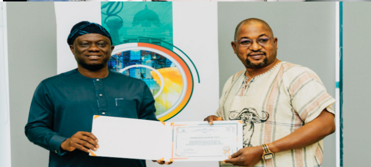
PAC Chairman presenting Certificate to Clerk PAC