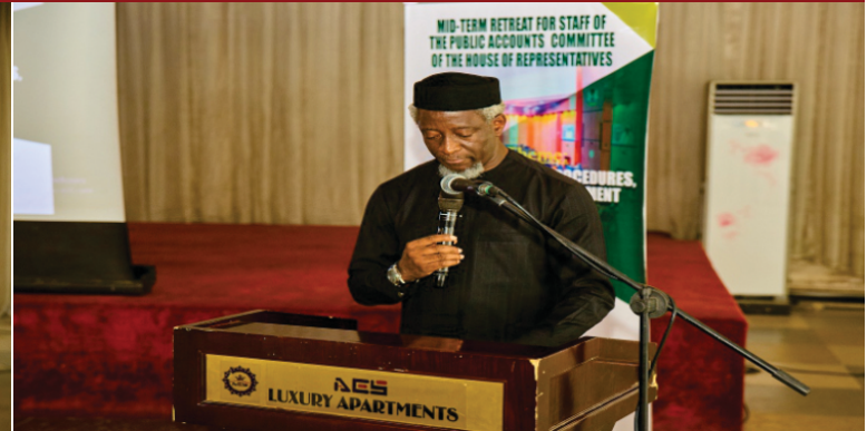
Welcome address from NMDPRA Chief Executive Officer represented by DFA Director