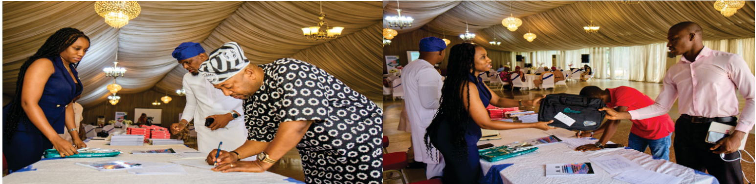
Participants registration at the Mid-Term Retreat for staff public accounts committee of the House of Representative