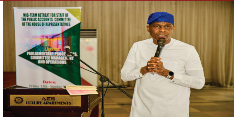
Welcome address from BOSHYBOF CONSULT Chief Executive Officer