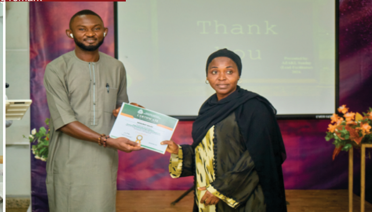
Presentation of Certificate