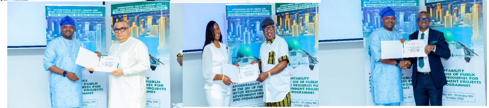
Presentation of certificates