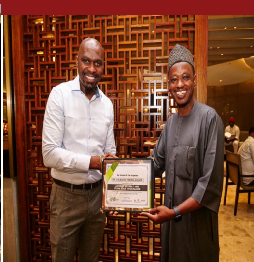
Presentation of certificates