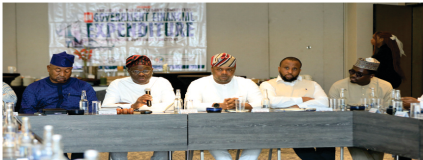
ENGAGEMENT SESSION WITH PAC MEMBERS