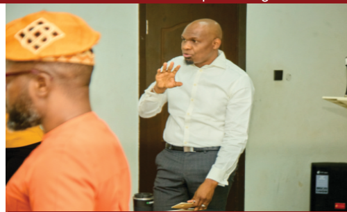
Session Engagement from MD/CEO of Boshybof Nig Ltd