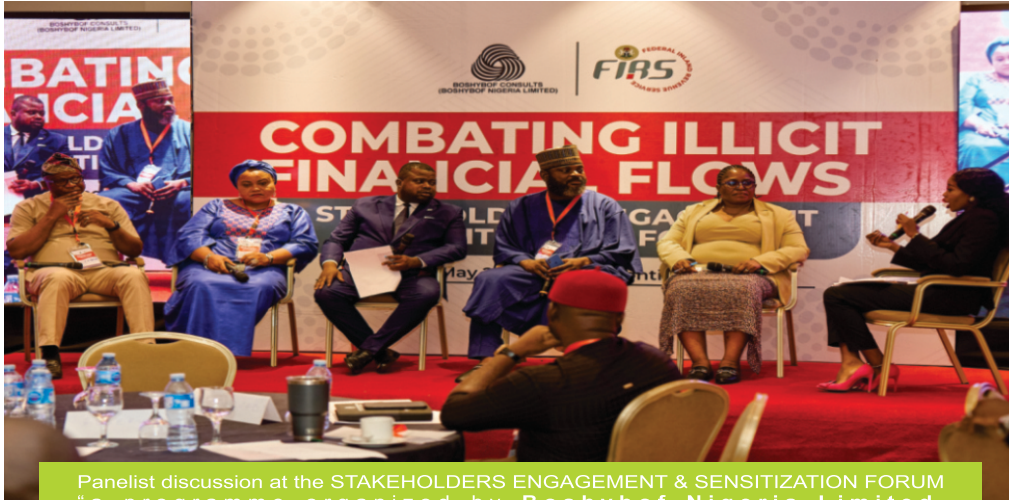
Panelist discussion at the STAKEHOLDERS ENGAGEMENT & SENSITIZATION FORUM “a programme organized by Boshybof Nigeria Limited , in Collaboration with The Federal Inland Revenue Service (FIRS)”