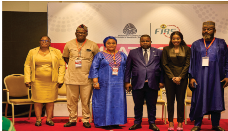
Panelist photograph at the STAKEHOLDERS ENGAGEMENT & SENSITIZATION FORUM “a programme organized by Boshybof Nigeria Limited , in Collaboration with The Federal Inland Revenue Service (FIRS)”